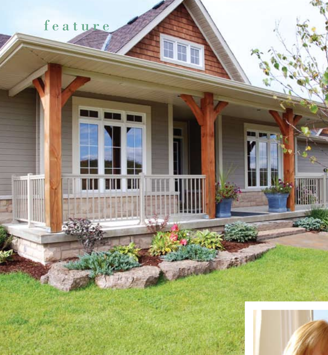
LEFT: One of several model homes in Pine Ridge Estates Minden has finished landscaping around a front porch accented with stained posts and braces.